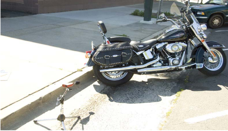
FIGURE 2-2. A motorcycle undergoing the SAE J2825 test procedure. Note the test requires there be no curb within 10 inches of the exhaust outlet. Photo presented at roundtable by MIC.