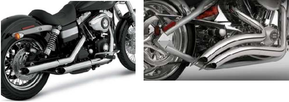
FIGURE 4-1. Exhaust systems that appear to have little or no muffling installed. Obtained from Internet post-roundtable.

Such acts are considered tampering and violate § 205.162-2 and § 205.173-2, as discussed in Chapter 5. In addition, a rider can readily buy a competition-use exhaust system for his or her street-legal bike: “We all know that when you walk into a dealership, you don’t have to certify whether you’re going to use it on or off the road; so you can buy whatever you wish,” Feith added.