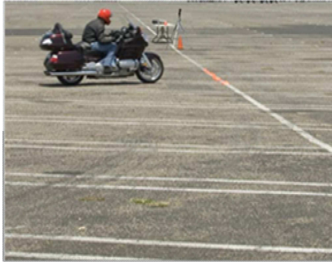
FIGURE 2-1. A motorcycle undergoing the EPA noise test procedure.

motorcycles during multiple maximum acceleration tests. The test requires experienced professional drivers. Even with experienced drivers, the test is dangerous to perform. See Figure 2-1.