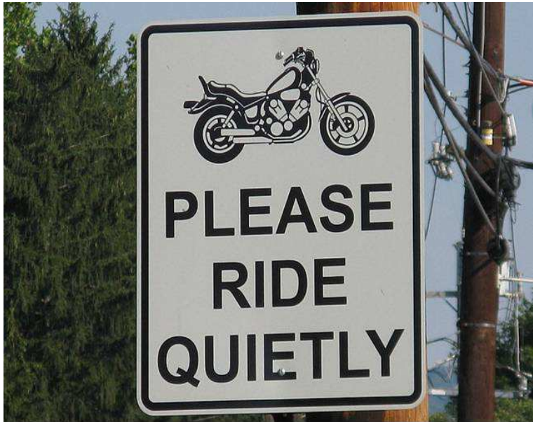
FIGURE 7-1. A sign posted on Maine roadway.