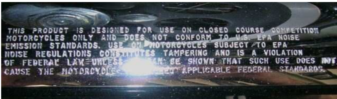
FIGURE 4-2. Harley-Davidson Screamin’ Eagle brand aftermarket exhaust system for a Harley-Davidson FLT. Supplied post-roundtable.

Some people, according to Tim Welch of Yoshimura R&D of America, will change their street or off-road legal bike to use it as a racing bike, take it to a track to race it, then change it back to a street legal bike and ride it to work. It is unlawful to ride these motorcycles on the street because the exhaust system has been modified (along with other parts of the bike) for racing, making them no longer street or off-road legal. However, they are permitted for competition on the racetrack. The regulation states exhaust systems that are manufactured and sold for such use must be labeled “for competition use only” or “not legal for street or off-road use” (see Figure 4-2). This report does not address competition bikes, unless they are used on the road. “Competition motorcycle” (as defined in 40 CFR205.151(a)(3)), means: “any motorcycle designed and marketed solely for use in closed-course competition events.” This does not exempt “off-road motorcycles” from compliance.