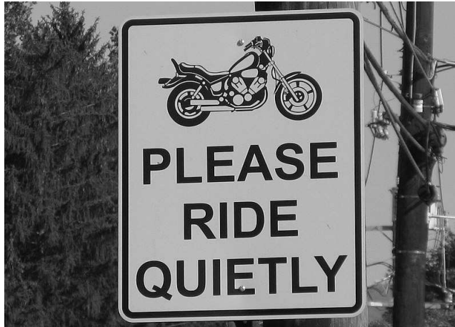
Roadside Sign in Maine