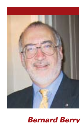
European News Editor I-INCE VP-Europe, Africa

We know that community response to noise is a complex problem, with many non-acoustic factors influencing response. With this enlargement to an even more diverse set of countries with national characteristics and differing social expectations, are we confident that the research base on which